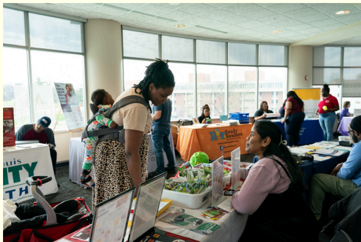
Participants making their way to different vendors at the Community Resource Fair.

In March of 2024 we hosted our annual Community Resource Fair. Different organizations from St. Louis City and County set up tables at the fair in hopes of connecting the community to essential resources. In 2024, we hosted 74 vendors at the fair and had 100 attendees .