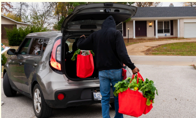
A Red Circle employee loading greens into cars at the Thanksgiving Turkey Giveaway.