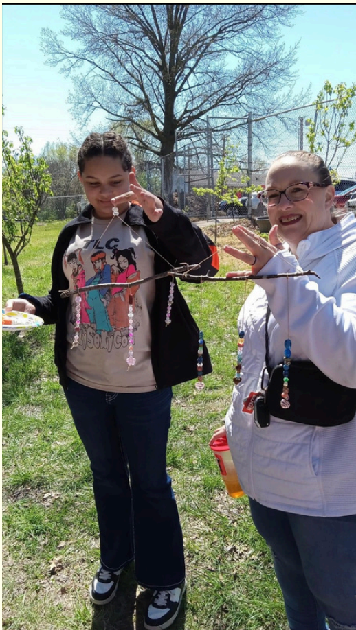
A mother and daughter displaying the crafts made during Art in the Garden.

Art in the Garden is a seasonal outdoor arts and crafts program that brings creativity and energy to our garden and farm spaces. Community members can join us for hands-on crafts, live music, great food, and meaningful connections. In 2024, we hosted 2 Art in the Garden events with a total of 62 attendees .