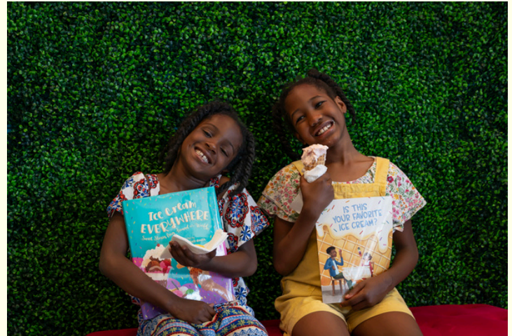
Two girls take home books and ice cream after a Sundae Stories event.

Sundae Stories is a free summer reading program designed to make reading fun for K-5 th graders students. The program includes story time (books read by community members), free ice cream and books. Literacy resources are also available upon request. In 2024, we hosted 4 Sundae Stories events and had a total of 82 attendees .